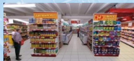
Supermarkets: While customer pays in, cashier can attend to the next customer