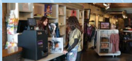
General Retail: Cashier does not interfere in the cash operation.