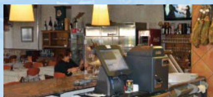
Restaurants: The POS always balances even with several cashiers working with it.

The automated cash counting means customers pay directly into the CashDro, preventing the movement of cash at the point of sale and eliminating counting errors, shrinkage and minimising potential theft. Recognising and rejecting counterfeit coins and notes is a vital function of the system which also reduces losses.